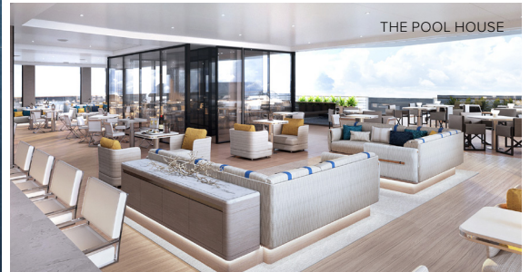
THE POOL HOUSE